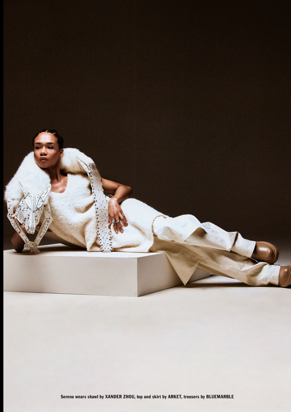
Serena wears shawl by XANDER ZHOU, top and skirt by ARKET, trousers by BLUEMARBLE